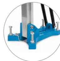
Compact dowel foot